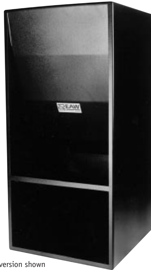
P version shown