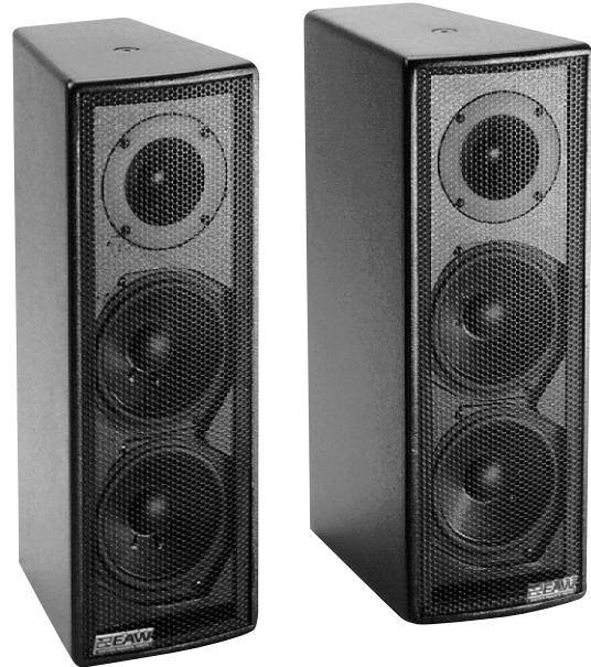
Shown as Pair